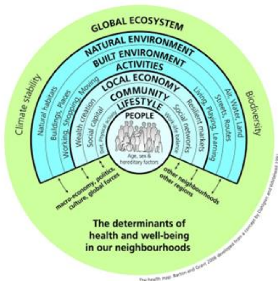
Figure 1 - Barton and Grant. 2006. The Health Map . Developed from a concept by Dahlgren and Whitehead 1991.

2.8. Whilst the rainbow model provided by Dahlgren and White covers a wide variety of determinants that influence health, the Health Foundation have identified 8 key wider, or social, determinants of health that can be acted upon to help increase peoples opportunities to live a healthy life. These determinants are: